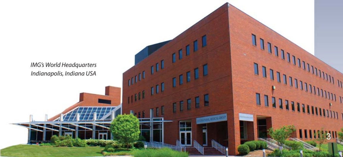
IMG's World Headquarters Indianapolis, Indiana USA

GCMI covers the Usual, Reasonable and Customary (URC) charges for eligible expenses in the area where you receive treatment. Each insured person will only need to satisfy their deductible once per period of coverage (12 months). For eligible expenses incurred in the U.S. and Canada (if applicable): once the deductible is met, GCMI pays 80% of the next $5,000 in eligible expenses, then 100% of eligible expenses up to the policy maximum. For eligible expenses incurred outside of the U.S. and Canada: once the deductible is met, GCMI will pay 100% of eligible expenses up to the policy maximum.